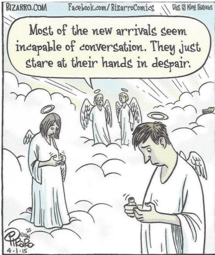
Will there be cell phones in Heaven?